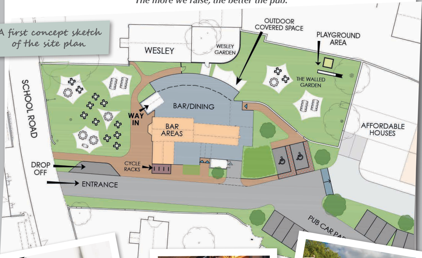
A first concept sketch of the site plan

Hence the strap line on the front of this document – ‘The more we raise, the better the pub.’