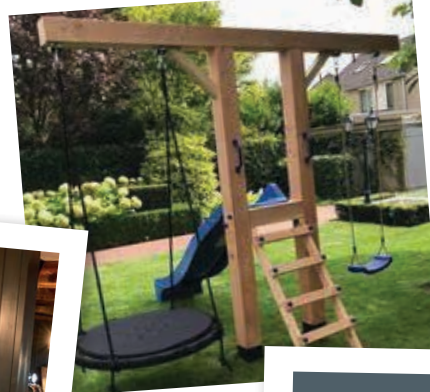
Children's play area

ECE, as a CBS, is run as a not-for-profit organisation. All assets are locked into the CBS and used solely for community benefit with any surplus being re-invested in the business or used solely for the benefit of the community as a whole. The purpose of this 'asset lock' is to ensure that any retained surplus or residual value cannot be appropriated for the private benefit of members but is distributed to charitable local benefit. Having such a formal asset lock is important. It provides assurance that any surplus or any value remaining after a dissolution of the society (following the discharge of any debts and the repayment to shareholders of the nominal amount of their shareholding) cannot be distributed to the members / investors.