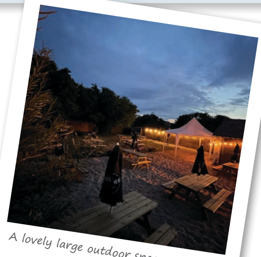
A lovely large outdoor space to gather

We are passionate to build something wonderful with our community