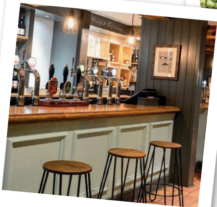
Open & airy