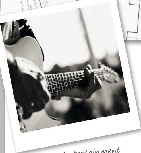
Entertainment & live music