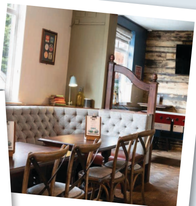
Simple & stylish