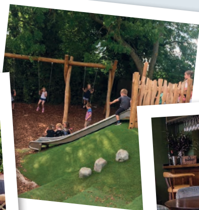
Plenty of space to eat & drink