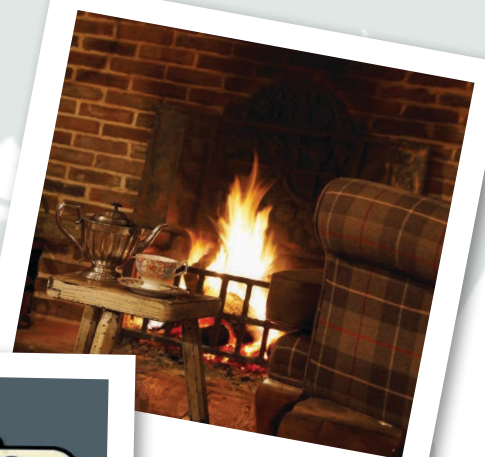
A cosy atmosphere