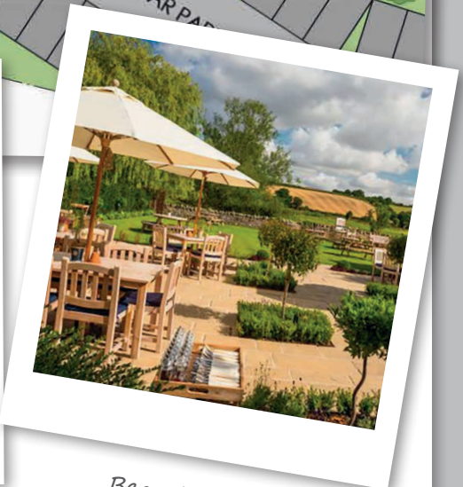
Beautiful outdoor spaces